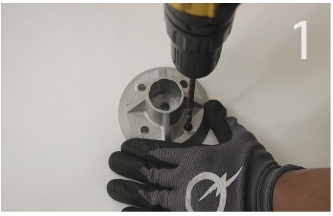
Locate the desired mount placement per the plan set. The mount can be attached to structural members or direct to the roof deck based on site-specific criteria. Using the base as a template, mark the penetration points with either a pen or light drilling. When attaching to a structural member, use two opposing holes on the base plate, parallel to the structural member.

Note: The QBase Mount ships without fasteners, allowing the project engineer to specify the fastener that best fits the project requirements. Prior to installation insure you procure the appropriate type, size and quantity of fasteners for your application. For rafter attachment, use two 5/16" x 3" Stainless Steel lag screws, ensuring minimum penetration of 2" into the structural members