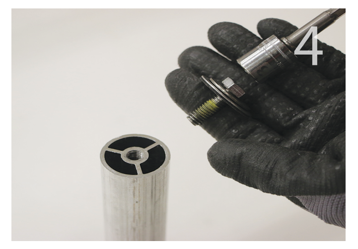
Attach the top hardware to the top of the post. This ensures the post will be sealed from weather exposure before racks are installed. You are now ready to flash the mount, roof around it, and attach racking. For built-up roofs and membrane roofs, be sure to use manufacturer-specified flashing methods or utilize the services of a certified roofer.

For additional Information refer to the QBASE Tech Tips: QBase Tech Tip