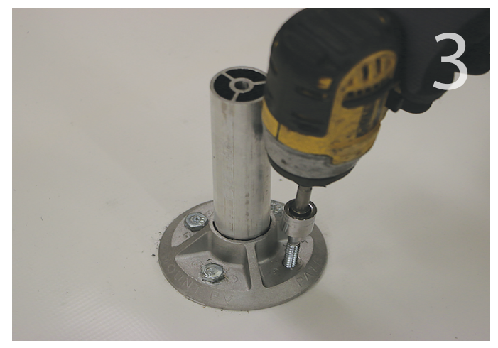
Prior to attaching the base to the roof, place the grade-8 hex bolt into the bottom of the base. Fully seat the post into the base, using slip-joint pliers if necessary. Attach the base and post assembly to the roof with the fasteners specified for the project.