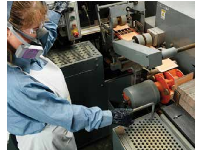
AGM PLATE WRAPPING & STACKING - Advanced AGM plate wrapper automatically delivers the highest levels of repeatable quality ensuring product integrity and performance.