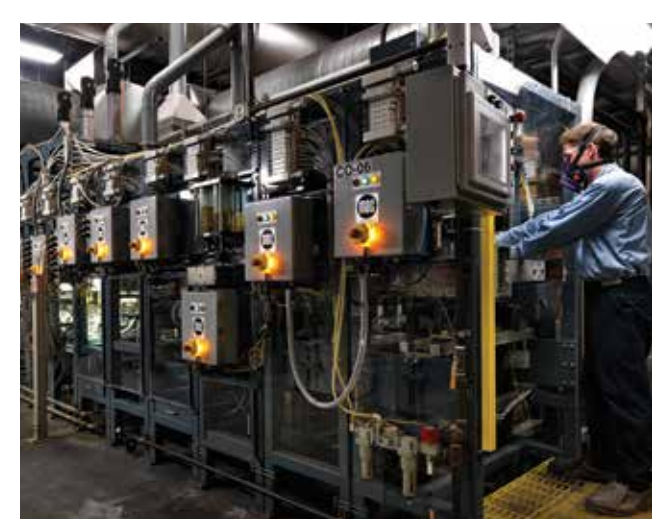
AGM INLINE CELL ASSEMBLY - Cells are loaded and move through a completely automated C.O.S. assembly process. The Inline C.O.S. Assembly process is a "Best-in-Class" manufacturing feature that delivers finished product integrity benefits that are unmatched in competitive terms.