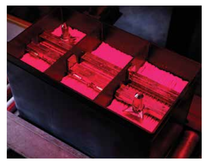
AGM VISION SYSTEM – This advanced process capability safeguards product integrity by verifying key battery components are correctly oriented and inserted into the container.