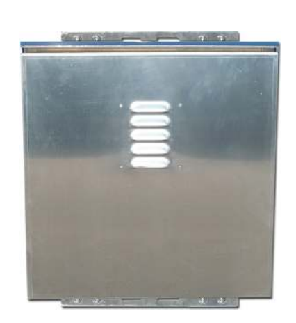
Mounts on wall using 4 lag bolts (Bolts not included)