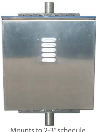
Mounts to 2-3" schedule 40 pole using 2 u-bolts (Bolts not included)