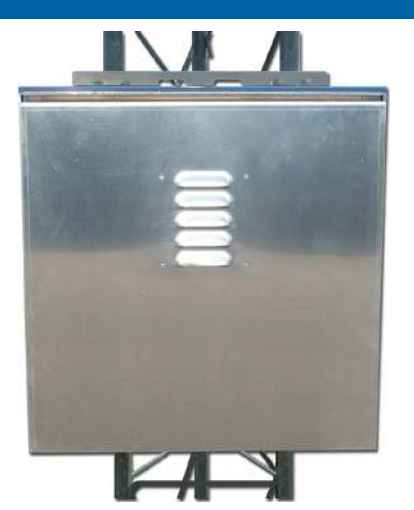
Mounts to ROHN25 tower using 4 u-bolts (Bolts not included)