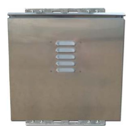
Mounts on wall using 4 lag bolts (Bolts not included)