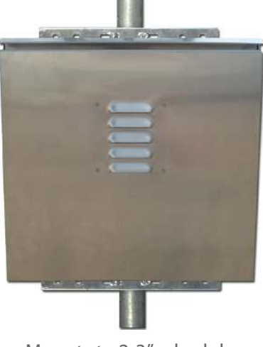
Mounts to 2-3" schedule 40 pole using 2 u-bolts (Bolts not included)

Mounts to ROHN25 tower using 4 u-bolts (Bolts not included)