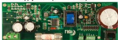
Power Supply Board (MNDiscoPSB)

SMA requested that MidNite Solar design and build Combiners that will be compatible with their TL series inverters. These DLTL combiners preserve SMA's unique emergency power back up feature during grid failure. The MNPVHV8-DLTL-3R, MNPVHV8-DLTL-4X and MNPVHV16-DLTL-4X are specifically designed for the new dual channel MPPT transformer-less inverters with an AC outlet that can be powered during a utility outage. The two MNPVHV8 DLTLs have four strings entering the combiner with 2 separate strings out while the MNPVHV16 has eight strings entering and two strings out.