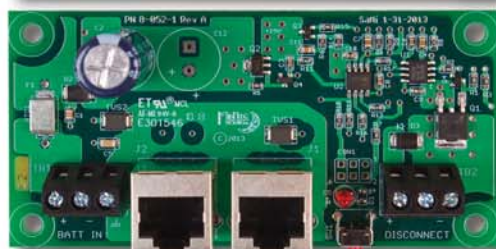
Battery Disconnect Module (MNBDM)