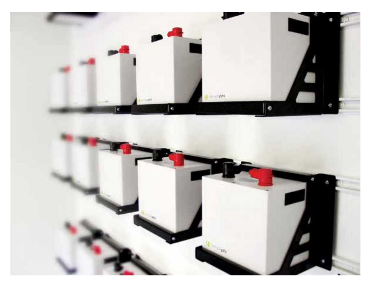
Figure 2.0 - PHI2.6<sup>™</sup> 48 Volt, 2621 watt-hour (2.6kWh) Smart-Tech Batteries: Residential Installation