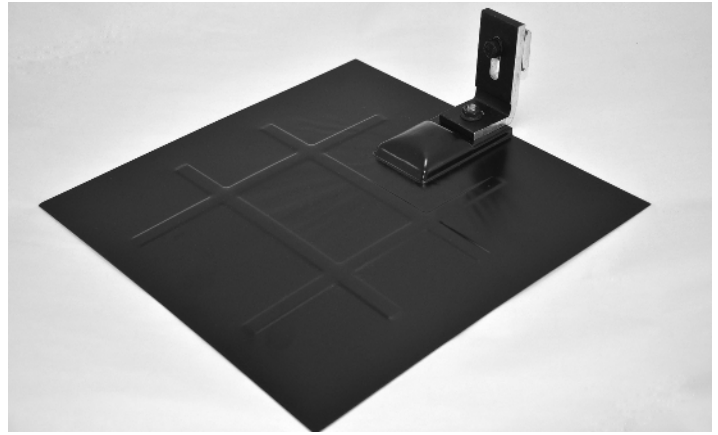
Flashed L Foot Kit Assembled