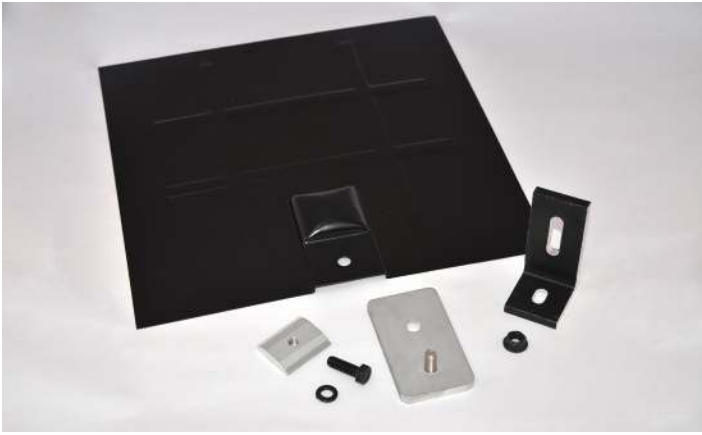
Flashed L Foot Kit Parts