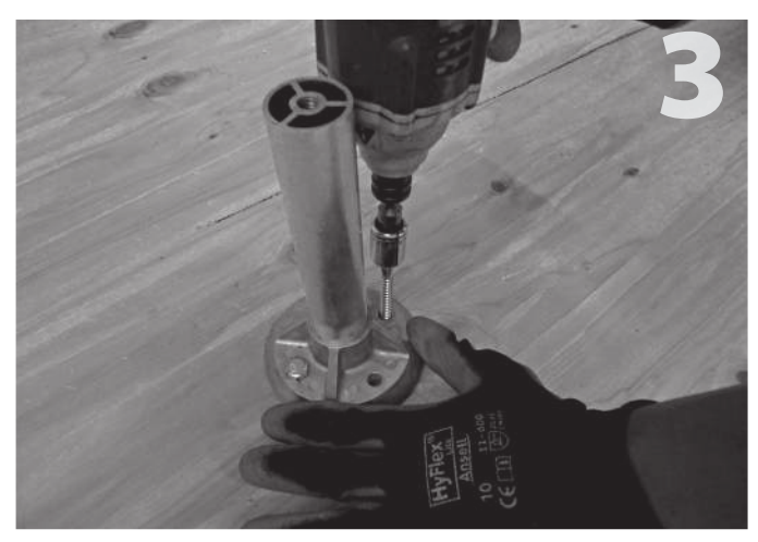
Prior to attaching the base to the roof, place the grade-8 hex bolt (item 1) in the bottom of the base (item 2) and screw the post (item 4) in. This is easier than adding the post after securing the base to the roof. Attach the base/ post assembly to the roof with two lag bolts (item 3).

Drill both pilot holes with a 7/32-inch bit. Make sure to hold the drill square to the rafter. The lag bolts must be anchored into a structural member, so it is very important to hit the center of the rafter with your pilot holes. Fill the pilot holes with a sealant compatible with roofing materials.