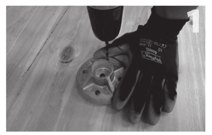
Locate the desired mount placement over a rafter (or custom wood blocking). Using the base as a template, mark the two penetration points with either a pen or light drilling. Use two opposing holes on the base plate, parallel to the structural member.

Installation Tools Required: Drill with 7/32" bit, impact gun with 1/2" socket, 1 tube of sealant compatible with roofing materials, pencil, chalk line