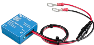
Bluetooth sensing Smart Battery Sense