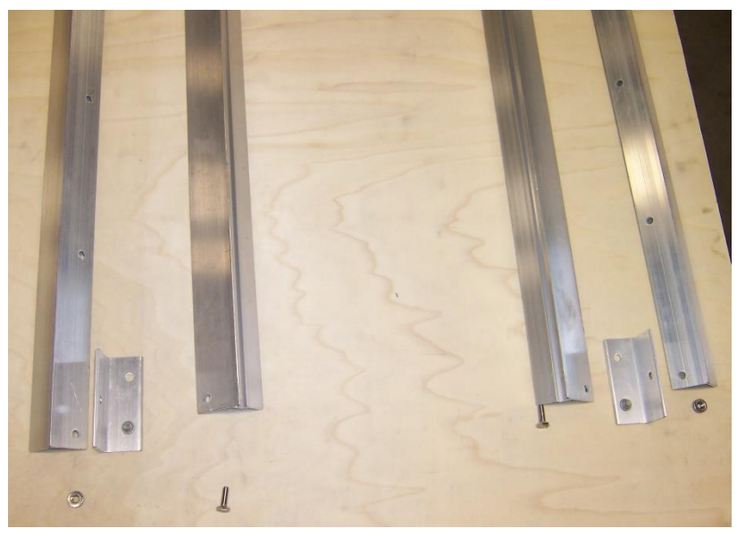
Pick the tilt angle you desire, somewhere between the two angles shown. Place bolts in corresponding holes and tighten. Make sure panel is held to bottom of rails to allow braces to clear panel in upright configuration.