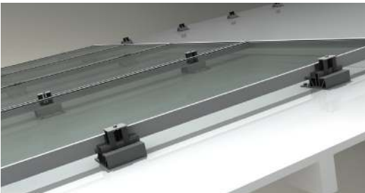
No Measuring-Module is used as jig