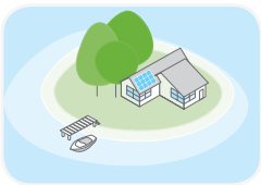
Residential off-grid solar