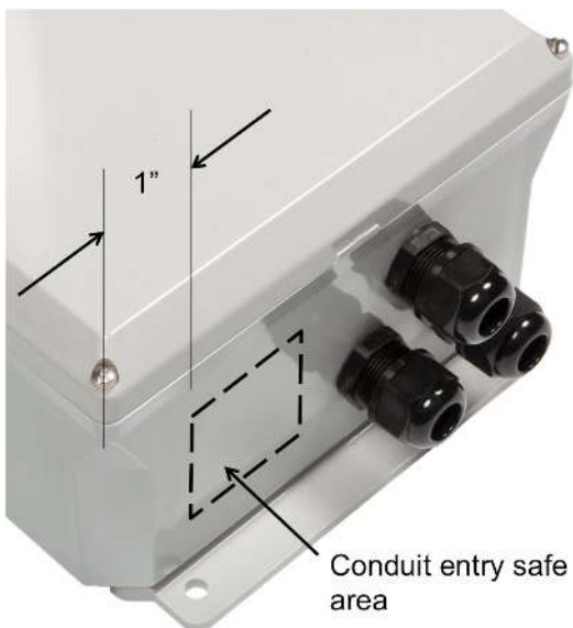
Conduit entry safe area