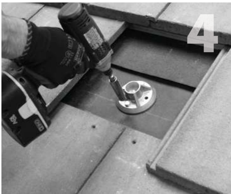
Align QBase over rafter center and drill two 7/32" pilot holes. Place grade-8 machine bolt under QBase in hex slot, threads pointing up. Lag QBase into rafter on marks.