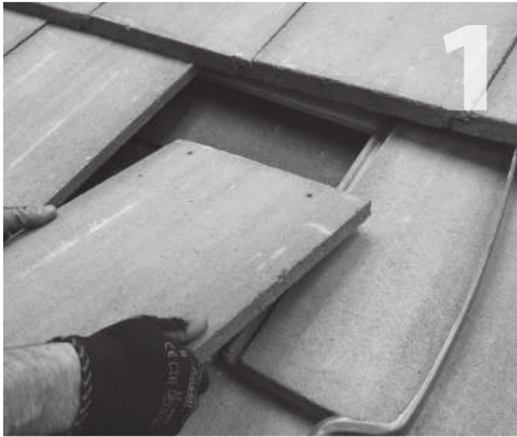
Remove tile at selected location of mount.

WARNING: Quick Mount PV products are NOT designed for and should NOT be used to anchor fall protection equipment.