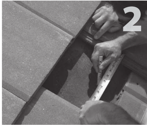
Locate and mark center of rafter.