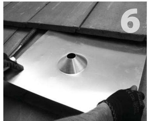
Cut a hole in the tile removed, with room to get the post through. Replace tile in position. Insert post and tighten into place. Install the 18"x 18" flashing and apply sealant around the opening.