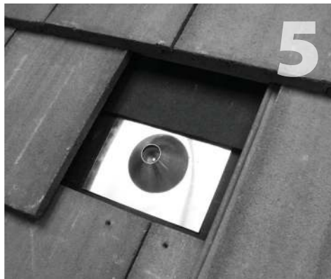
Carefully clean the building paper then install sub-flashing. Waterproof at underlayment level according to roofing manufacturer instructions and Tile Roofing Institute Guidelines.