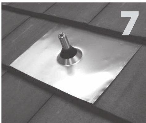
Apply sealant where post and flashing meet, and install counter flashing collar. (Be sure to seal off the post from weather exposure with the sealing washer, in the interim before racks are installed.)

You are now ready for the rack of your choice. Follow all the directions of the rack manufacturer as well as the module manufacturer.