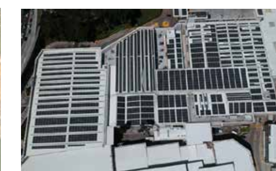
Big Box Stores