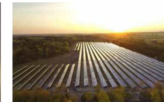
Community Solar/Ground Mount