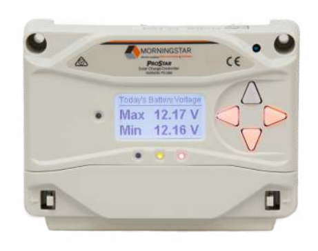
New ProStar (Gen3) shown with optional meter

The ProStar solar charge controller has been the leading mid-range pulse width modulation (PWM) controller since 1995. With over 350,000 units installed in the harshest environments in over 100 countries, the ProStar has developed a strong reputation for reliable performance. This third generation ProStar maintains the same quality and form factor as previous models, while offering new data, lighting control, graphical interface, and protection features to better meet the needs of off-grid solar applications.