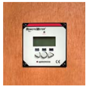
In Wall Mount