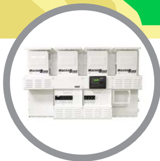
Magnum Energy MPDH Panel and four MS-PAE Inverter/Chargers