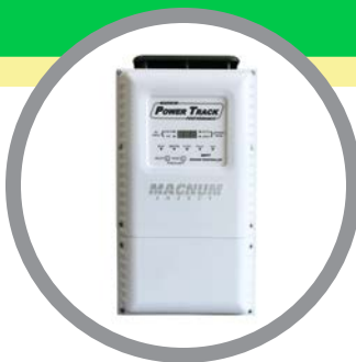
Up to seven (7) PT-100 Charge Controllers for 42kW output at 48V